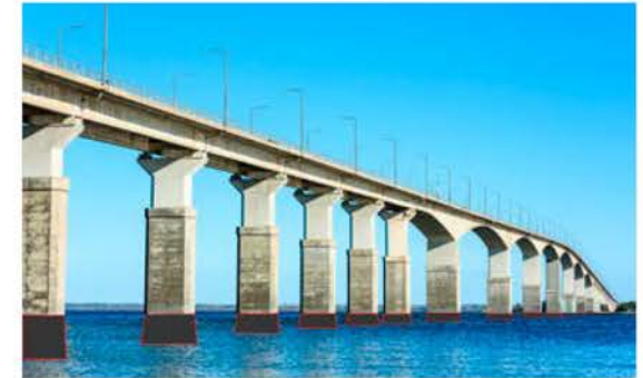
SEAL Bridge foundation