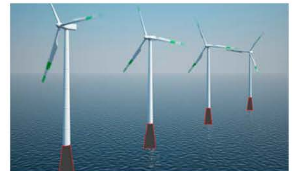
SEAL Wind turbine foundation